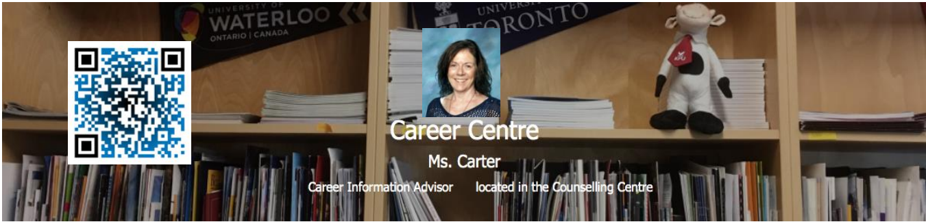
J.N. Burnett Secondary School