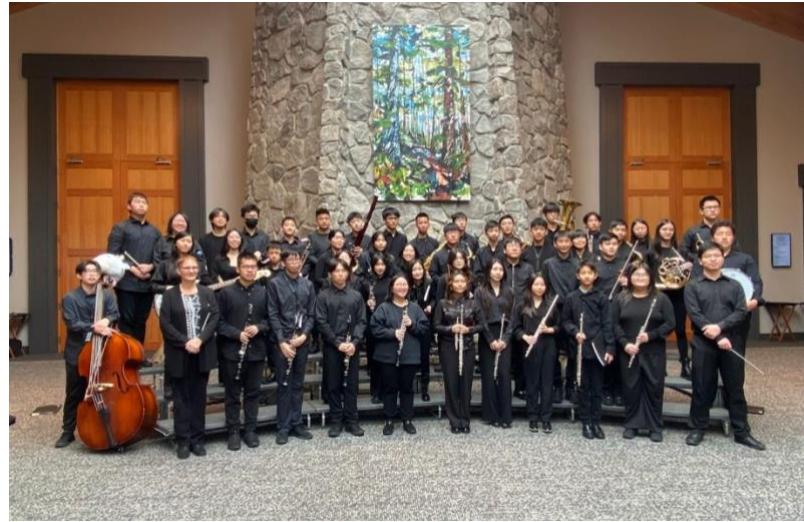
Burnett Concert Band Received Gold at Cantando Music Festival