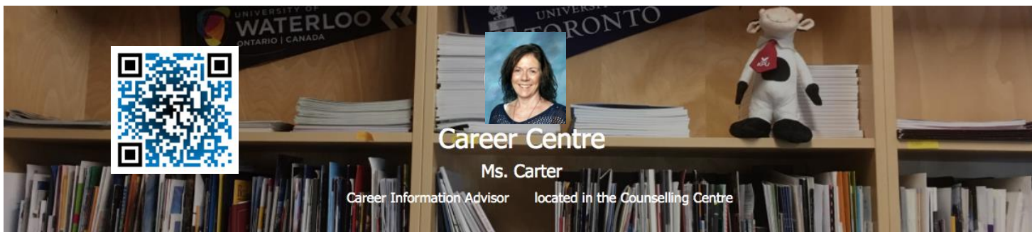
J.N. Burnett Secondary School Career Centre News